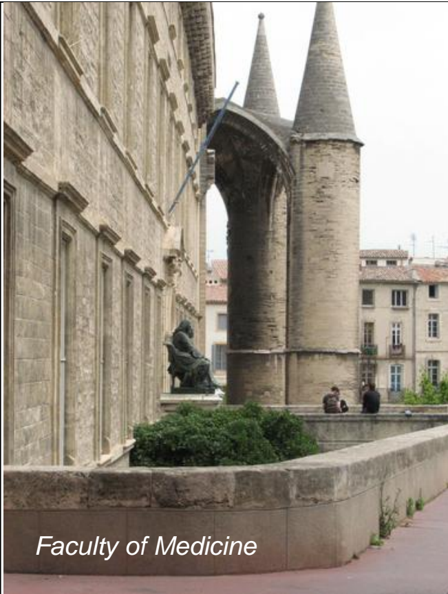
Faculty of Medicine

Symposia Set for the Serotonin Club Meeting Montpellier France, Faculty of Medicine, July 10-12, 2012 Official satellite of EPHAR meeting in Granada Spain July 17-22, 2012