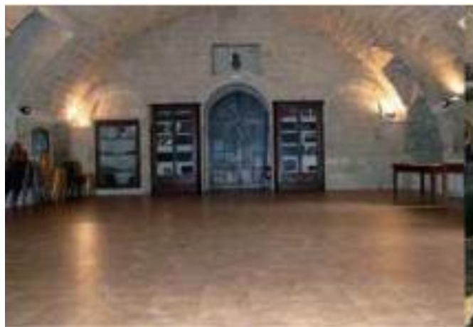
Room where posters will be held