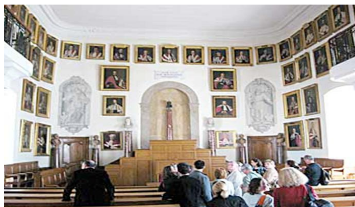
Salle des Actes – one of the symposia rooms