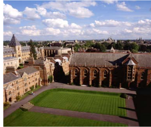
Keble College, Oxford